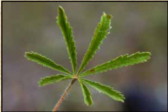
Compound leaf, 5 to 7 toothed leaflets