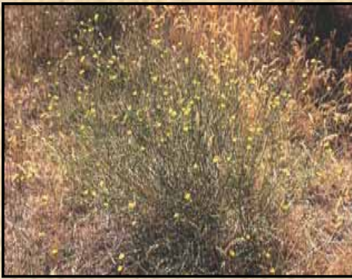
Plant in full bloom