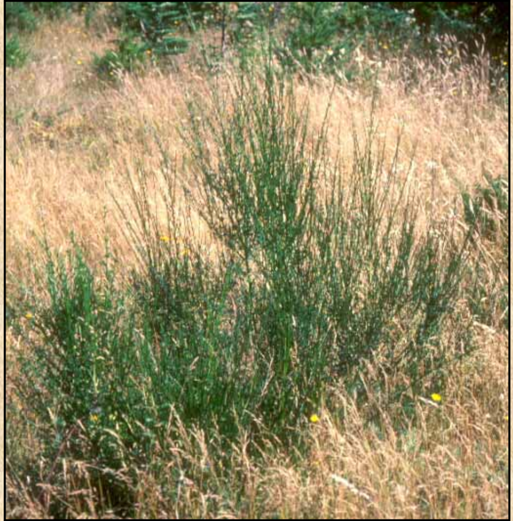
Pods eject seeds several feet from plant