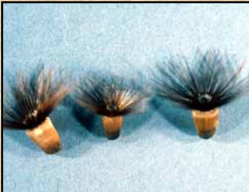
Dark stiff bristled seeds