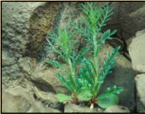
Fleshy cotyledons, red midrib vein