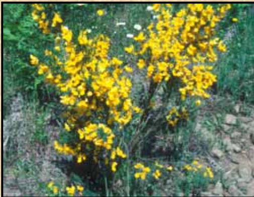
Flowers showy and abundant