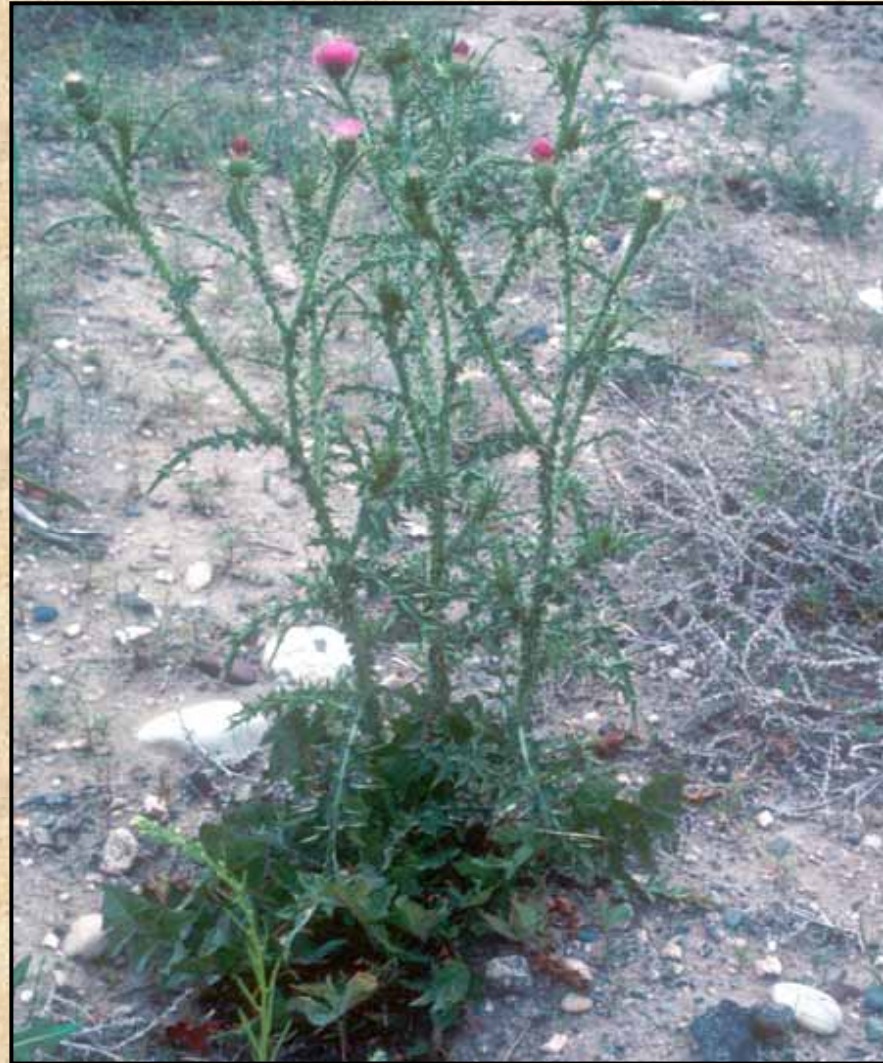
Prolific seed producer