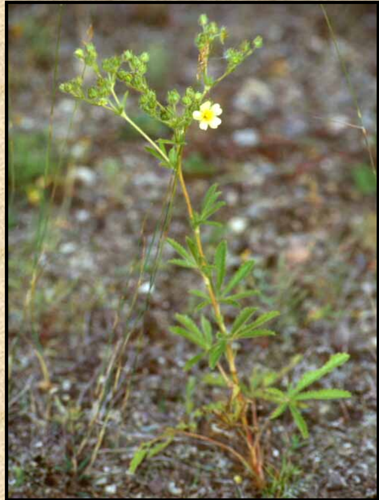
Sulfur-yellow flowers on mature plant