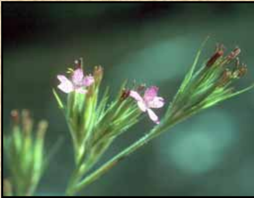
Purple ray flowers