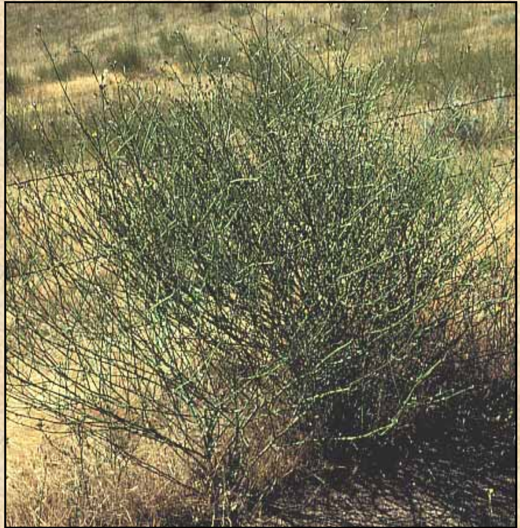
Mature stemmy plant with small leaves