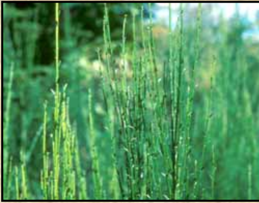
Multiple erect branches