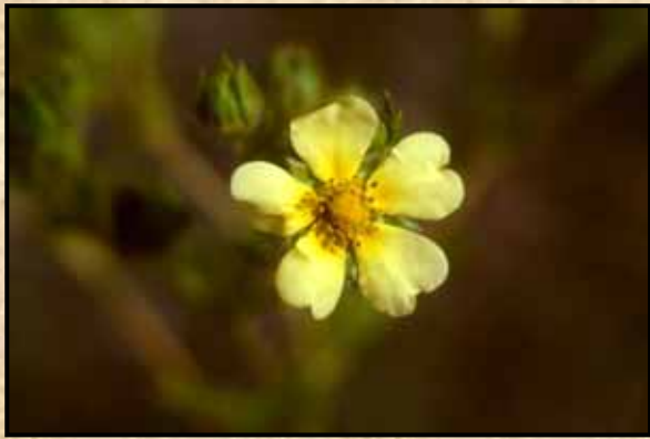
Flowers have 5 petals & deeply lobed