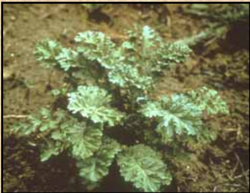
Deeply lobed rosette