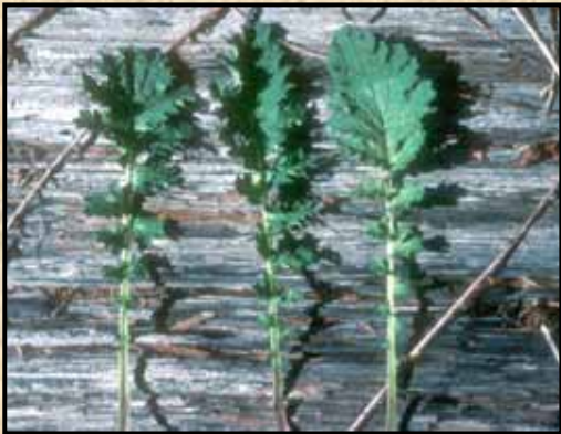
Leaves up to 8 inches long