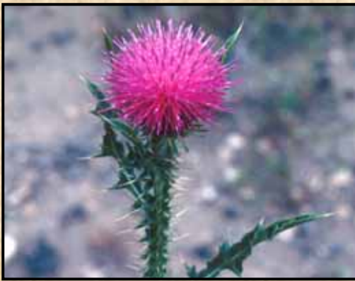
Red flower head sharp bracts