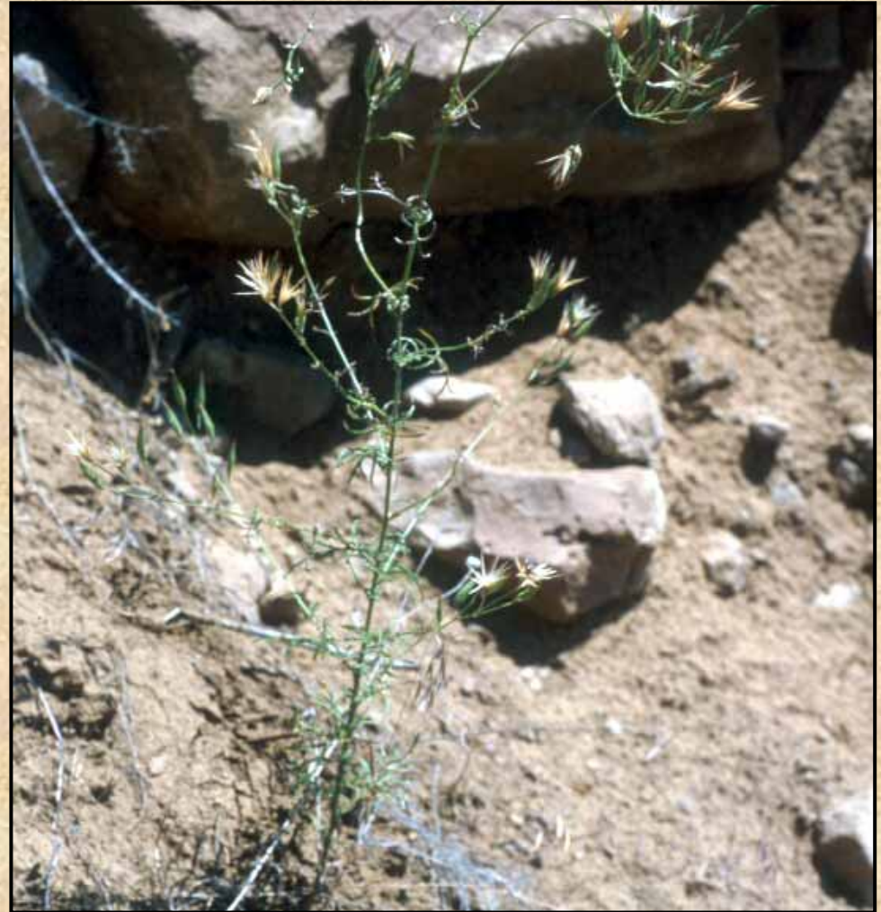
Mature plant dispersing seeds