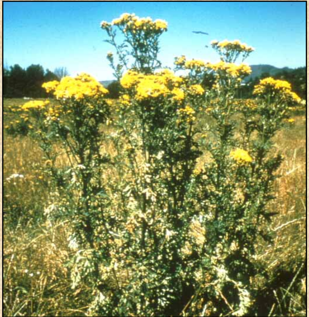
Infests millions of acres in the Pacific Northwest