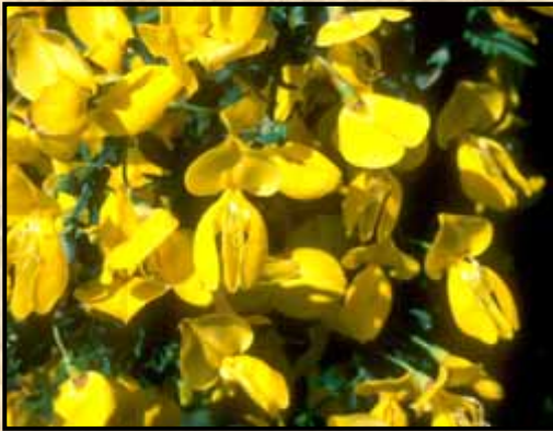
Yellow, legume flowers