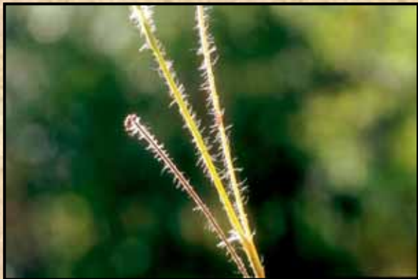
Long perpendicular hairs on stems